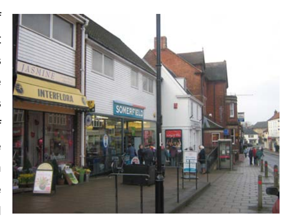
Table 10.6 below sets out the diversity of retail and services uses in the town centre. It is apparent that the composition of units is broadly in line with the UK centre average (albeit with a far lower vacancy rate, which is discussed later in this section). In terms of floorspace there is a lower than average convenience provision and higher than average service provision. This is due to the fact that, with the exception of Somerfield

(pictured) which comprises 300 sqm net, the convenience provision in the centre is primarily small independent units. However, there is also a large modern Waitrose store, with a total net floorspace of 2,400 sqm, located approximately one mile outside of the town centre.