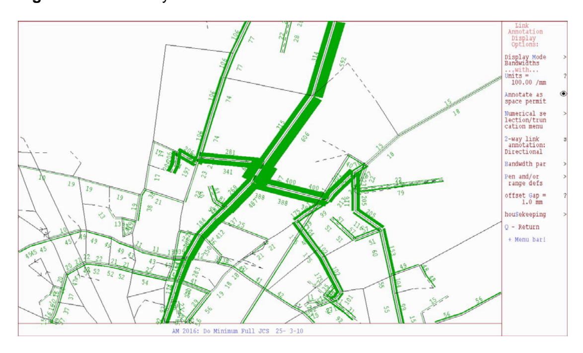
Figure 1 Model analysis of flows on North Walsham Road